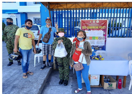
Snacks of pancit was also prepared for the frontliners assigned in checkpoints.

CTCA is also set to work with more organizations around the Philippines to provide food and other necessities to the vulnerables and less fortunate.